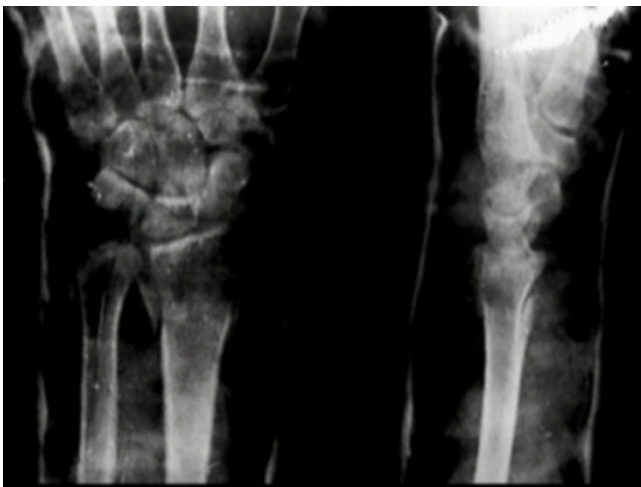
Figure 4 The post-reduction radiograph showing satisfactory reduction with almost complete restoration of volar tilt. Note carpal alignments including RLA and the SLA within the normal configuration.