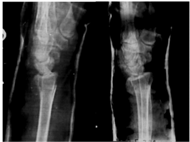
Figure 5 Two and four weeks post-reduction lateral radiographs showing progressive loss of the fracture reduction. Note progressive worsening of the carpal alignment with increase in the SLA, occurring simultaneously with continuing redisplacement of the fracture.