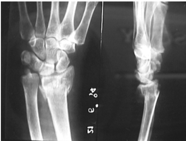
Figure 3 A distal radial fracture with midcarpal malalignment demonstrating dorsally rotated fracture fragment taking the lunate with it thus increasing the RLA and the SLA. Scaphoid does not follow the fracture fragment maintaining the normal RSA.