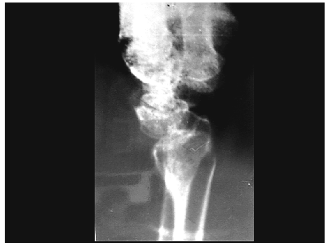
Figure 6 One-year old malunited distal radial fracture with radio-carpal malalignment showing ERLF of more than 25°. The carpal realignment is seen to occur entirely at radio-carpal joint producing its flexion at a magnitude much beyond the normal excursion. Lunate is seen dorsally subluxed though maintaining the normal RLA.

could almost always be corrected with reduction of the fracture (Table 2). Similar observations were made where the instability has most appropriately been described as pseudo-DISI (dorsal intercalated segmental instability) though only as a case report [16]. However, a study of thirty two patients observed scapho-lunate angle not to show much changes in pre / post-reduction and the one year follow-up radiographs [3]. This is not in conformity with our findings.