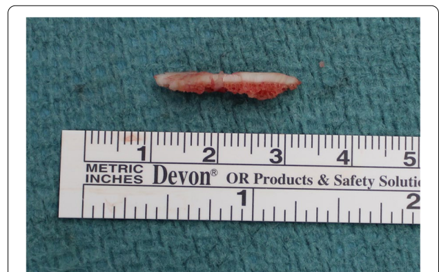
Fig. 3 In one patient a 22x4x4 mm osteochondral fragment of the anteromedial edge of the distal tibia had to be removed

Furthermore, the mechanism of injury was supposed to be a strong external rotation force with the foot in slight supination and in neutral or slight pronation in later stages [2]. Based on the fact that there was no damage to the posterior malleolus in their patient collective, Yoshimura [8] concluded that there is a strong possibility that the MFC could be a pronation external rotation type fracture according to the Lauge-Hansen classification. In four of our patients MFC occurred in a ski boot while skiing; Fritschy [18] also reported of Maisonneuve injuries in professional skiers with rigid ski boots, in which pronation or supination is theoretically impossible. Therefore, the mechanism of injury and potentially associated intra-articular damage have to be thought about.