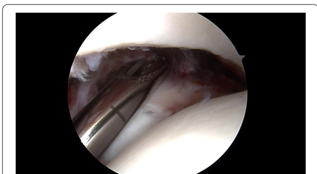
Fig. 1 Diastasis of the distal fibula was proven with a 4 mm shaver. In all cases an apparent syndesmosis instability of at least 4 mm was seen

27 months). No perioperative infections or wound complications occurred. After 10 months one patient needed revision surgery due to secondary syndesmosis and deltoid ligament diastasis and in one case of TightRope® fixation implant removal and arthroscopic scar debridement was necessary. None of the patients complained about secondary cartilage issues. At the time of last follow-up all patients were very satisfied or satisfied with the results.