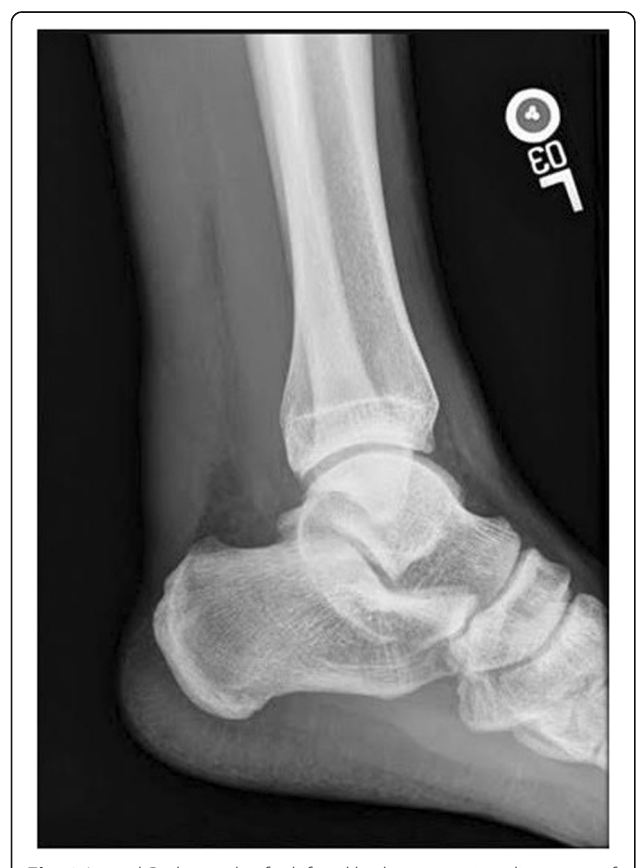
Fig. 2 Lateral Radiograph of a left ankle demonstrating disruption of Kager's triangle

Correlation analysis compared survey data on practice preferences, specifically need for further imaging, method of treatment, and post-operative management, with respondent's collected demographic data. One-way ANOVA and chi-square analysis performed on respondent data using SPSS software, (SPSS, Chicago, IL, USA), with a p -value of < 0.05 for statistical significance.