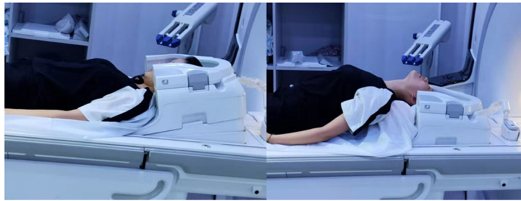
Fig. 2 The extension and flexion of cervical spine

incomplete dura compression, complete dura compression and spinal cord compression. After consent, all participants will receive dynamic MRI examination demonstrating the flexion and extension of cervical spine. The same classification of cord compression will also be applied to dynamic MRI. Meanwhile, the number of levels under moderate to severe compression is also important and we will record this together with cord compression degree.