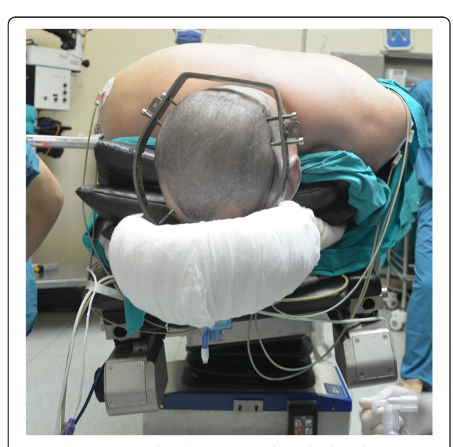
Fig. 3 The patient is placed prone on a plaster bed on the operating table, with several rectangular paddings filled between his ventral side and the plaster bed

The size of C6 and T1 facets to be excised should be carefully assessed before surgery and intraoperatively to avoid any compression of the nerve roots. Increased resection area provides ample space for osteotomy and instrumentation but may result in inadequate contact of the posterior column on closure of the osteotomy site, causing a gap, which may have an impact on the stability of the posterior column. In our morphometric measurements, the resected lengths of the C6 inferior facet and the T1 superior facet were 4.7 \pm 2.1 mm and 6.5 \pm 2.6 mm, respectively, for males. Intraoperatively, the C6 inferior facet or the T1 superior facet should be further removed, if the C7 and C8 nerve roots are not free. Reduction of the deformity was found to be the most critical step for a successful osteotomy, while intraoperative manual reduction was found to be the most basic and the most commonly reported technique [6, 23-25]. This technique required that the surgeon hold a Mayfield clamp or halo ring, while an assistant monitored the spinal dura and nerve roots. In our study, a plaster bed was placed on the Jackson table and the patient was placed in the prone position on the plaster bed with several rectangular paddings filled between his ventral side and the plaster bed (Fig. 3).