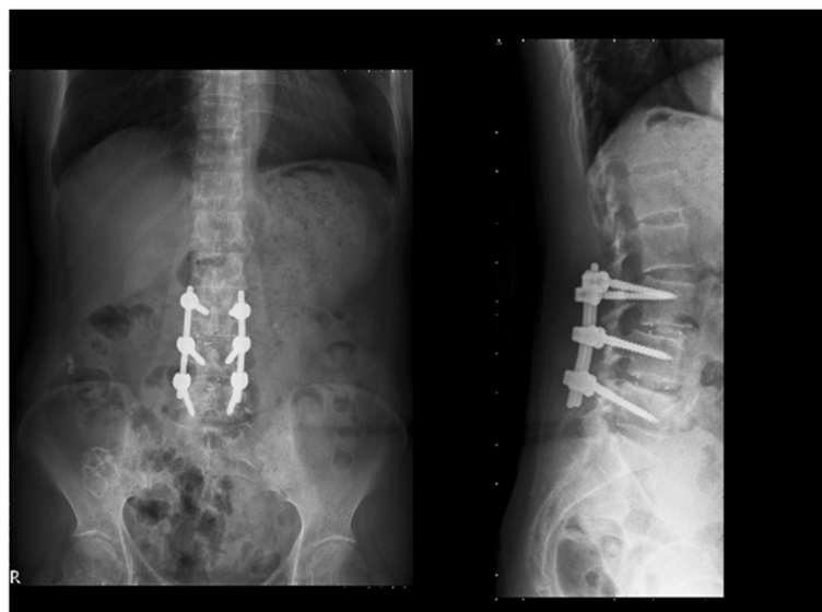
Fig. 2 A case in the IBF group: L3–4–5 posterior instrumentation, decompression, and interbody fusion with cages

Clinical outcomes were evaluated using the visual analog scale (VAS) and Oswestry Disability Index (ODI). The VAS was measured before the operation and the most recent clinical visit. ODI was acquired using a retrospective survey administered by phone contact with patients. Radiographic evaluations were performed at the most recent clinical visit to check the stability of the implants and the solidity of the fusion mass. The fusion rate of the PLF group was calculated for each segment. For example, there are 2 segments in L4–5 posterolateral