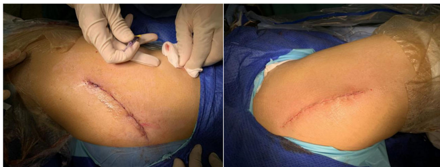
Fig. 1 The appearances of bilateral wounds in operating room (left: tissue adhesive; right: standard wound closure)

The HISTOACRYL® tissue adhesive (B.Braun, Melsungen, German) was applied evenly on the wound and waited air-drying for 30 s. When tissue adhesive got dry, wound was covered by wound dressing. During the hospital stay, patients and caregivers were told to inform nurses of dressing change if blood or exudate soaked the dressing, which was the standard protocol of postoperative dressing change. If dressing could keep dry and clean before discharge, patient wound received one dressing change. The dressing change caused by discharge was not recorded. All patients had antibiotics within 24 h, shower after 14 days and aspirin within 35 days postoperatively.