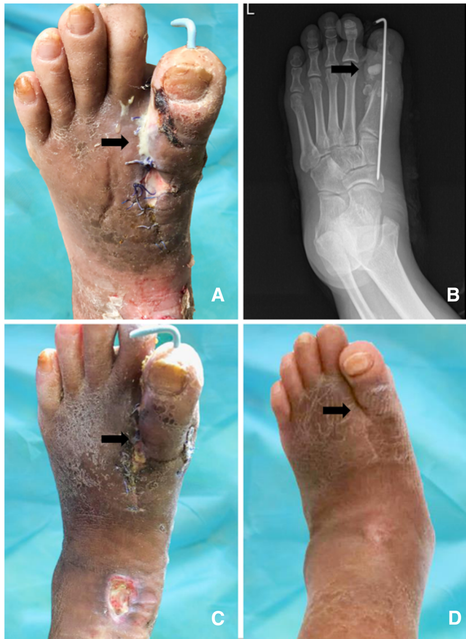
Fig. 2 A 62-year-old patient with DFO on left first metatarsophalangeal joint. The metatarsophalangeal joint, partial metatarsal and phalange were removed. a The postoperative leakage of calcium sulfate. This sterile leakage was demonstrated as a kind of white, foamy, antibiotics-containing fluid. b X-ray presentation. Vancomycin-impregnated calcium sulfate lump was degrading. c 7 weeks after operation, the skin needed to be moistened. Superficial ulcer in ankle could be managed with dressing. d 1 year after surgical treatment. Although edema was presented, the operative wound healed and the symptoms of infection were disappeared

sulfate treatment. During an average follow-up of 10 months, infection eradication and wound healing were achieved in 90 and 81% limbs respectively [25]. Proper explanation of the high healing rate is that much higher antibiotic concentration reached topically can eradicate more residual organisms with the resorption of the calcium sulfate. Former studies have shown antibiotic levels surpass 200 times the MIC [14] for organisms over days