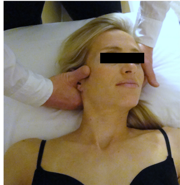
Fig. 1 High-velocity low-amplitude thrust manipulation directed to the right C1-2 articulation. The subject provided consent for her image to be used

Manipulations targeting the right and left C1-2 articulations and bilateral T1-2 articulations were performed on at least one of the 6–8 treatment sessions (Figs. 1 and 2). On other treatment sessions, therapists either