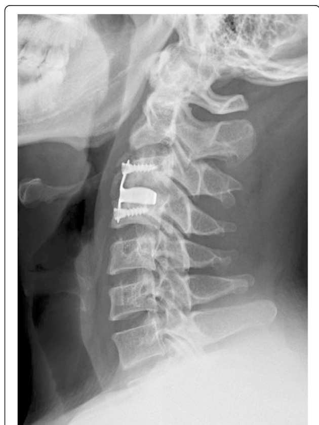
Fig. 3 Lateral radiograph showing C3 and C4 screw loosening and heterotopic ossification formed 5 months after the operation