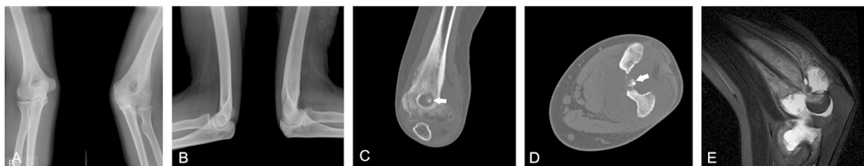
Figure 2 A 14.1-year-old boy with an intra-articular osteoid osteoma of the olecranon fossa with involvement of the elbow joint. (A, B) Anteroposterior (A) and lateral (B) radiographs show hypertrophic deformation around the left elbow joint. (C, D) Coronal (C) and axial (D) CT images demonstrate the nidus (arrow) at the olecranon fossa. (E) Sagittal T2-weighted MR image with fat suppression shows a heterogeneous intermediate signal intensity of distal humerus with a high signal intensity around the elbow joint indicating bone marrow edema with synovitis.

There are some limitations of this study that should be considered. First, the number of patients, especially with intra-/juxta-articular osteoid osteoma, was small. We suspect that prolonged hyperemia and synovitis due to diagnostic delay might have caused the severe hypertrophic deformation around the joint that led to permanent