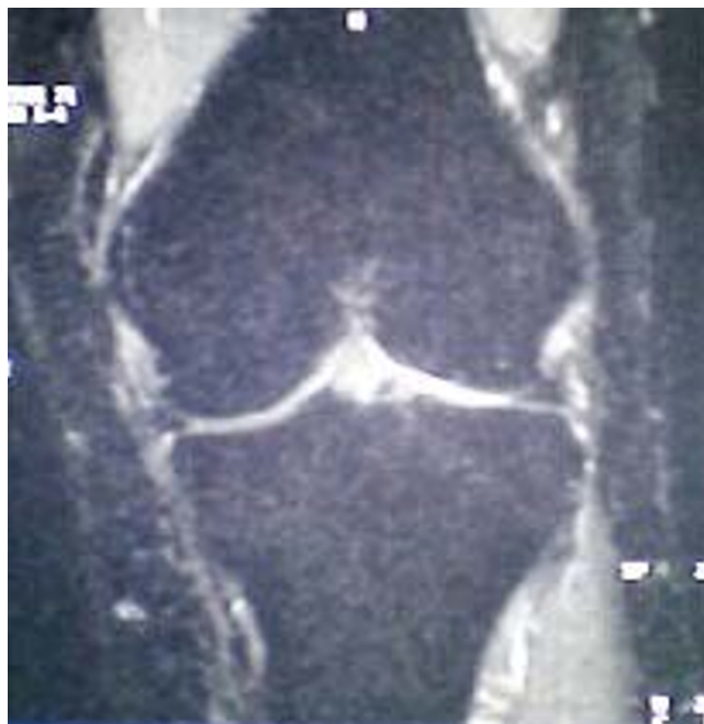
Figure 7 Complete normalization of the MR imaging signal pattern after 10 months.