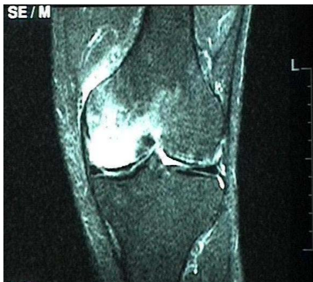
Figure 2 48-year-old man with a large BME in the medial femoral condyle not limited to the subchondral bone on the initial T2-weighted MR investigation (STIR).

The severity of effort-induced pain (VAS) was reduced from 7.5 (2.0–10.0) at baseline to 5.9 (2.4–7.9) after 3 months and to 0.6 (0–0.9) after the final examination. Pain at rest (VAS) diminished from 3.9 (1.5–7.8) to 2.8 (1.4–6.0) after 3 months and to 0 at the final follow-up. In one patient with BMES in the knee, avascular necrosis of the contralateral hip was evident within 16 months, which is being treated conservatively until the present time. All active patients were able to return to the same level of sports as that prior to commencement of their symptoms.