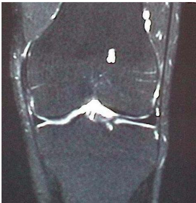
Figure 4 Complete normalization of the MRI signal pattern after 6 months of conservative treatment.