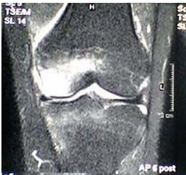
Figure 5 44-year-old woman with a extensive BME in the medial femoral condyle which is not limited to the subchondral area on the T2-weighted MR investigation (STIR).