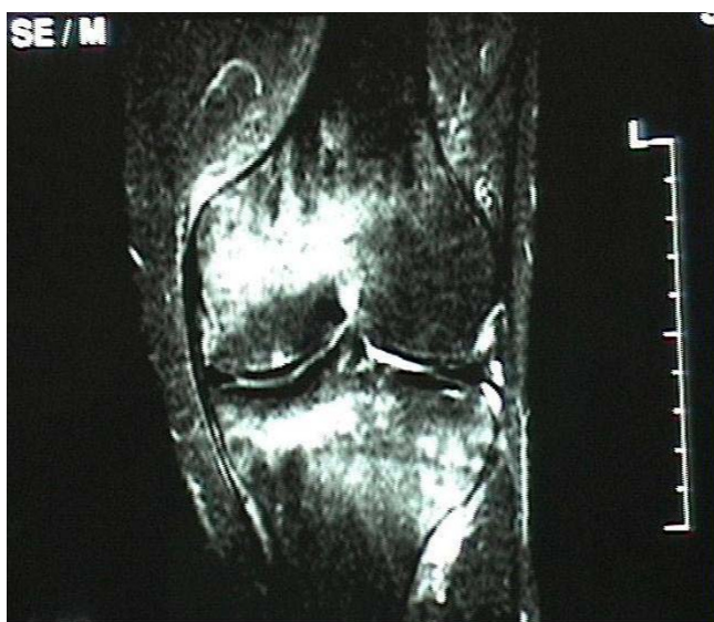
Figure 3 The MR investigation shows a shift of a large BME to the medial and the lateral tibial plateau, and a reduction in the size of the BME in the medial femoral condyle 3 months later.

In 1959 Curtiss and Kincaid [13] reported three cases of young women who developed transient demineralization of the hip during the third trimester of pregnancy. Wilson