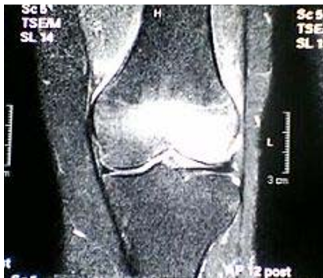
Figure 6 The MR image shows a shift of the large BME to the lateral femoral condyle, reduction in the size of the BME in the medial femoral condyle, and remission at the medial tibial condyle 4 months later.