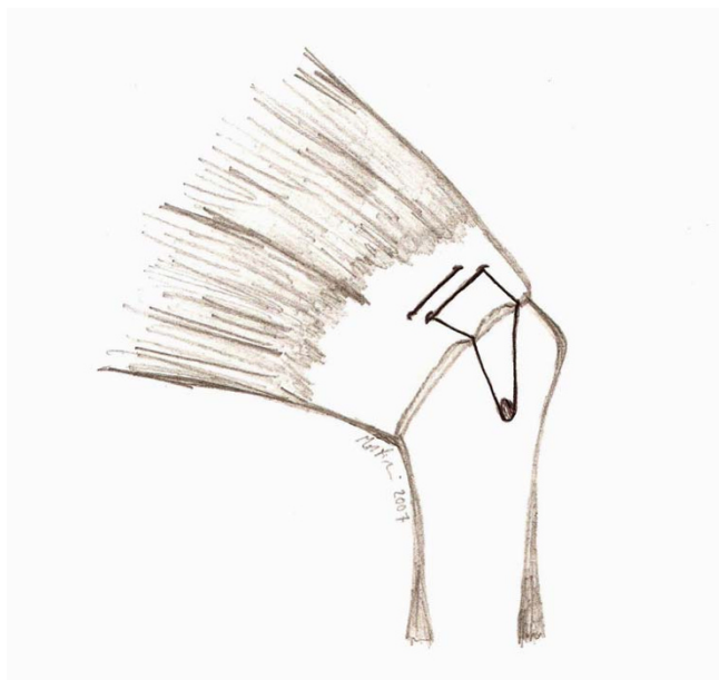
Figure 9 A schematic drawing of the Roman Bridge technique.

The final result is what we call the Roman Bridge: the combination of double pulley and suture bridges techniques (Fig 9).