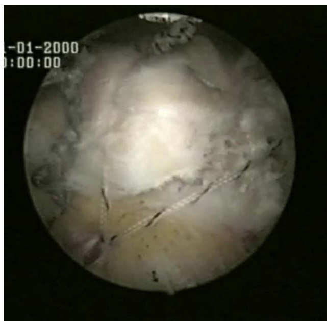
Figure 8 The final results.