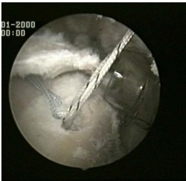
Figure 3 Two suture limbs from each anchor are sequentially passed through two single points in the rotator cuff.

The medial row sutures are tied using the double pulley technique. A suture limb is retrieved from each of the medial anchors through the lateral portal, and manually tied as a six-throw surgeon's knot over a metal rod (Fig 4).