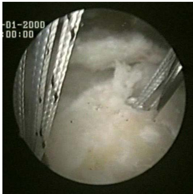
Figure 1 Two medial row suture Bio-Corkscrew anchors (Arthrex, Naples, FL), which are double-loaded with No. 2 FiberWire sutures (Arthrex, Naples, FL), are placed in the medial aspect of the footprint, just lateral to the articular surface of the humeral.

Two suture limbs from a single suture are both passed through a single point in the rotator cuff by means of a Penetrator or a BirdBeak suture passer (Arthrex), producing two points of fixation in the tendon, with a tendon bridge between them (Fig 2, 3). This is performed for both anchors.