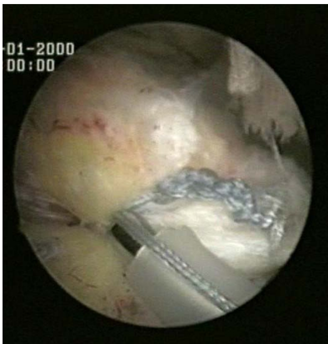
Figure 6 The two free suture limbs are tied with a Surgeon's Sixth Finger (Arthrex, Naples, FL) knot pusher as a static, nonsliding knot.