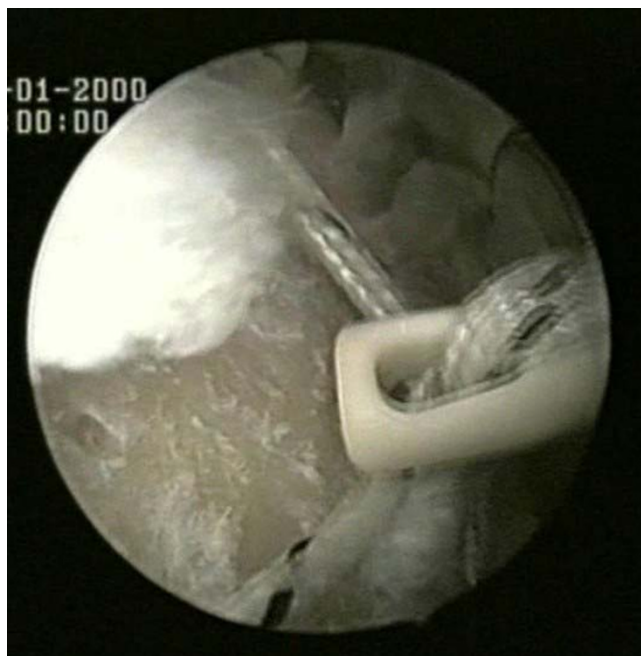
Figure 7 The two free suture limbs are used to produce suture bridges over the tendon, by means of a Pushlock (Arthrex, Naples, FL).

The suture limb is retrieved from each of the medial anchors through the lateral portal, and manually tied as a six-throw surgeon's knot over a metal rod. The two free suture limbs are pulled to transport the knot over the top of the tendon bridge. Then the two free suture limbs are used to produce suture bridges over the tendon, by means of a Pushlock (Arthrex, Naples, FL), placed 1 cm distal to the lateral edge of the footprint centered relative to the medially placed suture anchors anterior to posterior (Fig 7, 8).