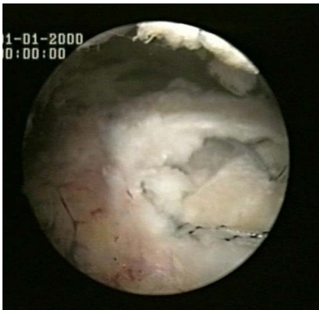
Figure 2 Two suture limbs from each anchor are sequentially passed through two single points in the rotator cuff.

The medial row sutures are tied using the double pulley technique. A suture limb is retrieved from each of the medial anchors through the lateral portal, and manually tied as a six-throw surgeon's knot over a metal rod (Fig 4).