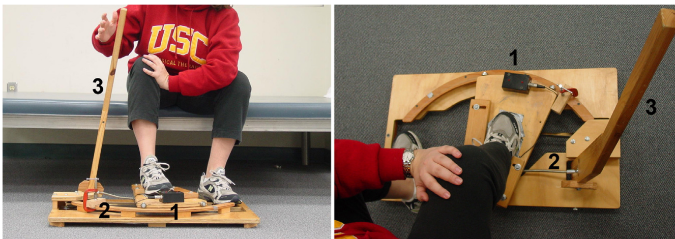
Figure 2 Exercise unit for isolated tibialis posterior exercise. (1) LED displaying static plantar flexion from pressure sensors under fore-foot; (2) Constant force extension spring for dynamic adduction; (3) Lever to allow passive adduction or abduction of the foot.

will be instructed in performing calf stretches as described earlier. A series of six, 30-second stretches on the involved