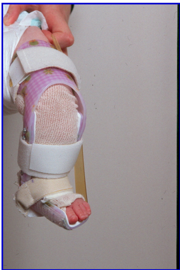
Figure 1 Dynamic Knee Ankle Foot Orthosis (with permission from

As a part of the ongoing study of the Clubfoot Assessment Protocol [1] psychometric properties, the purpose of this