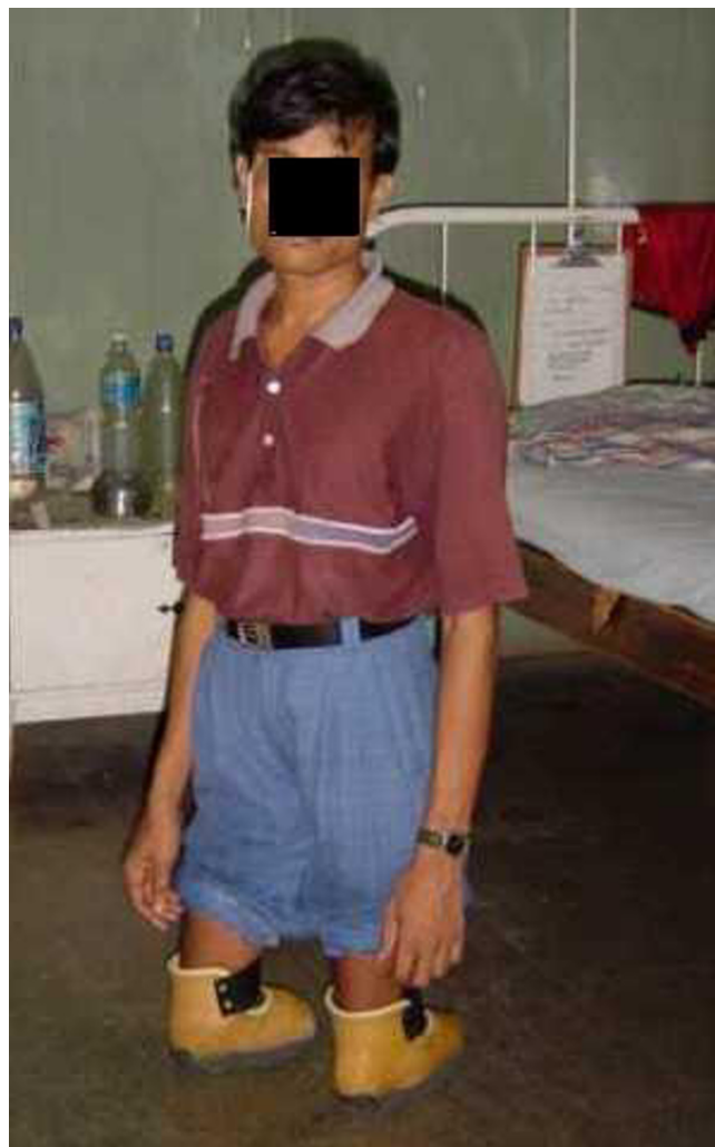
Figure 2 Patient wearing modified shoes

High-riding patella (known as Patella alta) leads to patellar instability [1]. In the presence of such instability, sudden laterally directed forces can lead to dislocation of the patella. The first episode of lateral dislocation of patella invariably damages the medial patellofemoral ligament (MPFL) which is the primary passive restraint to lateral