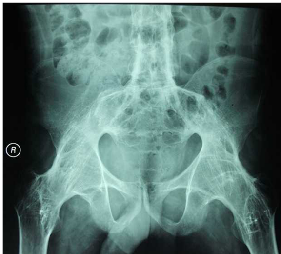
Figure 1 The radiographs of a 35-year-old male with AS was shown. The patient had bilateral bony ankylosis with 0° range of motion.

Patients were evaluated clinically using both subjective and objective information based on the HSS. Postoperative evaluation of patients was performed at six weeks, three months, six months, one year, and then annually.