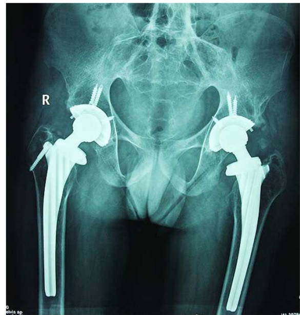
Figure 2 Postoperative radiograph of the patient two weeks after cementless THA.

Radiographic evaluation was also performed at each clinical interval. Cementless stem loosening was defined according to the criteria of Engh et al. [12] Heterotopic ossification was classified using criteria of Brooker et al. [13].