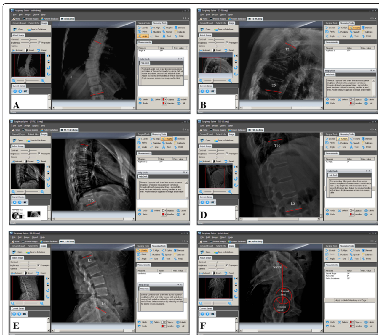
Figure 1 Cobb angle and sagittal parameters measured with SurgimapSpine tool, part of the spine is enlarged and the contrast changed. A is the measurement method of coronal Cobb angle; B and C is the measurement methods of T2–T5 and T5–T12, respectively; D and E is the thoracolumbar junction (TLJ: T10–L2) and lumbar lordosis (LL: L1–S1), respectively; F are the measurement methods of pelvis including pelvic incidence (PI), sacral slope (SS) and pelvic tilt (PT).

assessed by Pearson’s coefficient, there was no significant difference when compared with the ICC (Table 2) between the two methods. As for the intraobserver reliability, no notable difference was found between ICC and Pearson’s coefficient (Table 1).