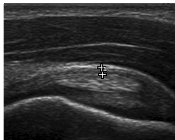
Figure 1 Example of coracohumeral thickness measurement. Note the tendon of the long head of the biceps below the calipers.