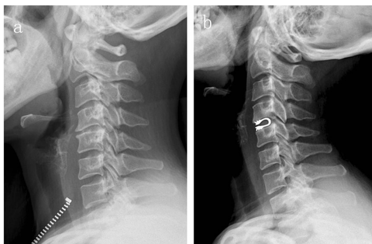
Figure 2 Preoperation and postoperation of DCI. a Preoperative lateral X-rays showed the height of C4-5 decreased, and kyphosis existed. b Postoperative lateral X-rays showed the kyphotic curvature retrieved.