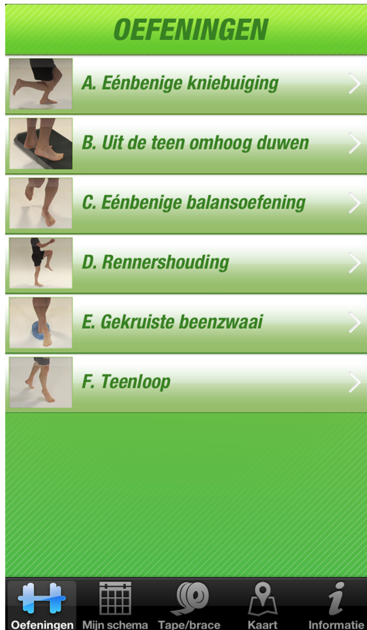
Figure 2 Basic exercises of the 'Strengthen your ankle' proprioceptive training program.

clarity of the instructions provided, difficulty of the exercises and recurrence of an ankle sprain.