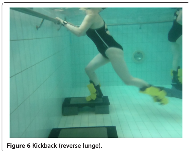
Figure 6 Kickback (reverse lunge).

work of 30 and 45 seconds with large boots. Week 12 will consist of one session barefooted, one with small fins and one with large boots, work duration will be 45 seconds per set. The frontal area of aquafin resistance fins is 0.0181 m 2 and that of the large resistance boots 0.075 m 2 . In a previous study the drag experienced during seated aquatic knee flexion/extension exercises in healthy women was triple with the large boots compared to the barefoot condition. Additionally, a significant increase in EMG activity was seen with the large boots compared to no boots [117,122].