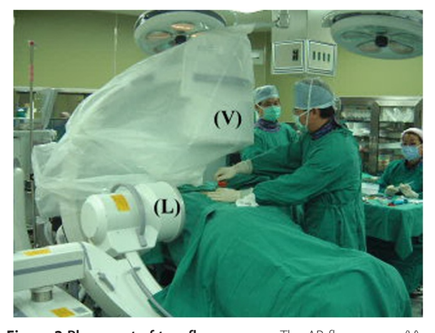
Figure 2 Placement of two fluoroscopes. The AP fluoroscope (V) is positioned vertically with the C-arm's pivot maintained at 45° or less to the long axis of the operating table. The C-arm of the lateral fluoroscope (L) is placed under the operating table horizontally while it is tilted away from the C-arm of the AP fluoroscope to prevent collision.