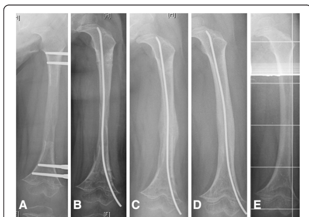
Figure 3 A-D Radiographic examination and diagnosis of a fracture in the regenerate during treatment. Boy (No 5 in Table 2) with femoral lengthening due to achondroplastic short stature, 5 years old: A) at the day of the removal of the fixator. B) day 0, after removal of the frame, one TEN was inserted due to prophylactic stabilization. C) x-ray at day 50 after removal shows a new callus formation within the regenerate, it must have been a fracture type 1b weeks ago, estimated caused by manipulation during insertion of the TEN, no other reason was applicable. D) 4 months (day 133) after removal of the fixator, before removal of the TEN with bony healing without loose of length or development of further malformation. E) late follow up, 1 year after removal of the TEN.

Lengthening then rodding is a new treatment protocol in femoral bone lengthening, which is capable of protecting the patient against fractures and secondary axial deviation for several months even after the fixator has been removed. The appearance of the regenerate using the Li classification scheme is not a predictive value for the probability of a fracture after frame removal. All fractures healed with the previously implanted TEN; repeat surgery due to a fracture was not required. Healing with relevant loss of correction of > 1 cm only occurred in one case. In one case (1%), premature removal of a TEN only 15 days after implantation was necessary due to soft-tissue infection. There is no general problem of infection due to the one-stage change from an external to an internal procedure, and infection need not be feared. Only single shot antibiotics during surgery were administered routinely.