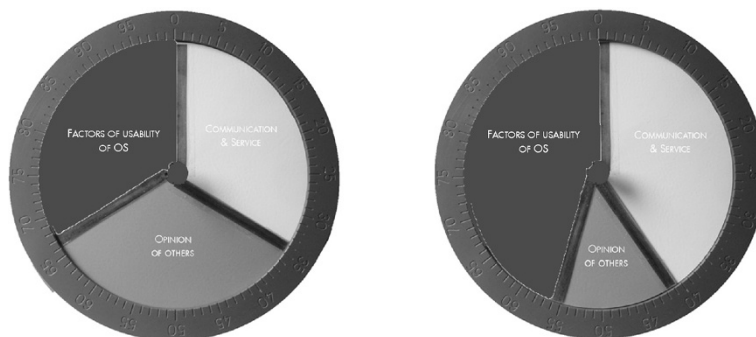
Figure 1 Disc used to measure the relative importance of the three domains of the interview [18]. Note: Two examples are shown. Left: this patient gave all three domains equal relative importance. Right: this patient gave the domains 'factors of usability of OS' and 'communication and service' almost equal relative importance, whereas the domain 'opinion of others' was considered to be less important. The score was measured from the second disc with the 100-point scale, which was placed around the circumference after the patient indicated to be satisfied with the result.