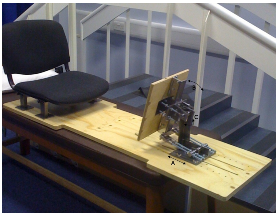
Figure 2 Loading rig. A: loading plate can be moved linearly to accommodate different leg lengths; B: plate can be tilted to give plantar/dorsi flexion of the foot; C: plate can be tilted to invert/evert the foot.

216 (interpolated); phase encoding, anterior to posterior; number of averages, 2.