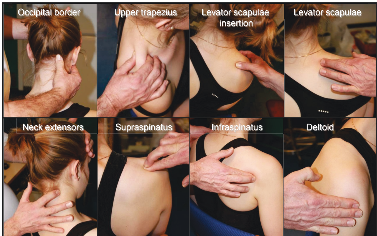
Figure 2 Palpation of the eight examined neck/shoulder locations (only illustrated for the right side).

The examiners determined tenderness by deep palpation of eight anatomical neck/shoulder locations on the left and right side. Based on the participants response and feedback during the palpation, the examiner used a score of 0-2, corresponding to 'no tenderness', 'some tenderness' or 'severe tenderness', respectively, for each anatomical location (Figure 2):