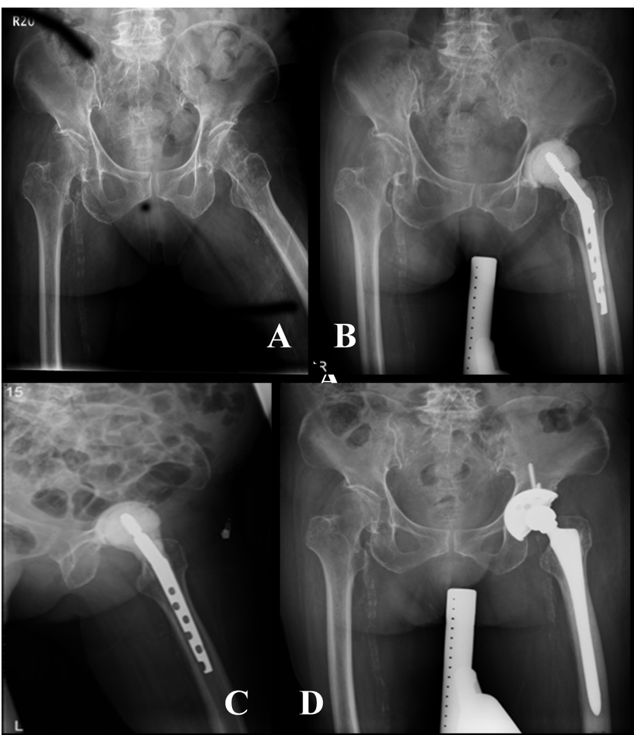
Figure 3 A: A patient with left primary hip septic arthritis; B-C: The patient was treated with antibiotic impregnated cement spacer augmented with hip compression screw after resection arthroplasty. D: After stabilization of infection, revision total hip arthroplasty is performed.