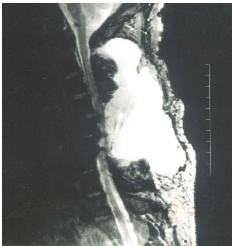
Figure 1 A giant pseudomeningocele noted after surgery for C5-C6 recurrent disk herniation. A 53-year-old male underwent cervical laminectomy and discectomy for C5-C6 recurrent disk herniation. After surgery, a giant cervical pseudomeningocele (length, 11 cm; width, 5 cm; depth, 5 cm) was noted on T2-weighted MRI.

a subarachnoid catheter for drainage. The purpose of the present study was to evaluate the clinical results of treating giant pseudomeningoceles by the surgical method described above. Risk factors for the formation of giant pseudomeningocele were also discussed.