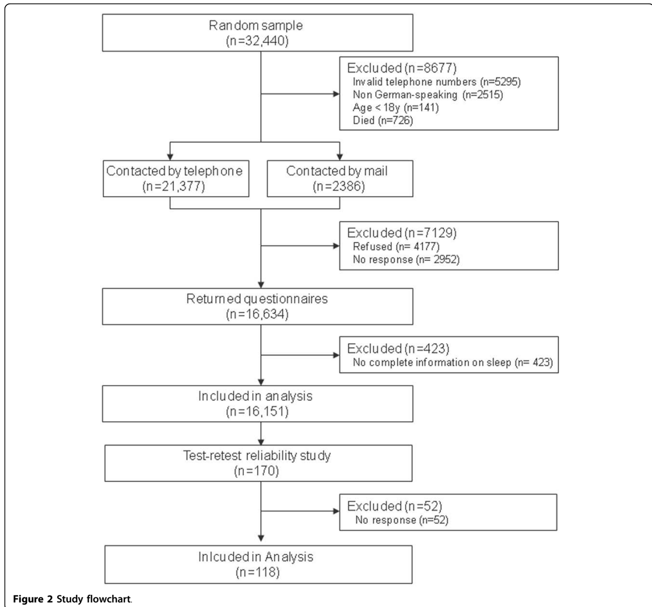
Figure 2 Study flowchart.

Müller et al. [31]; ICCs and weighted kappa statistics were used. Values larger than 0.60 were considered to be substantial [38] and items were discarded if the estimated ICCs or kappa values were below 0.60 [39].