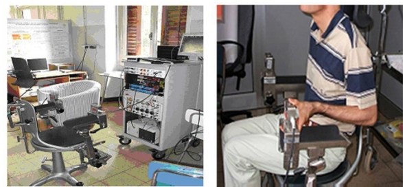
Figure 1 The load cell. Illustration of the load cell used for the hand grip muscle strength measurements used in the study.

Data from 2 patients, both males aged between 30 and 40 years, were obtained. Both patients had a muscle disorder