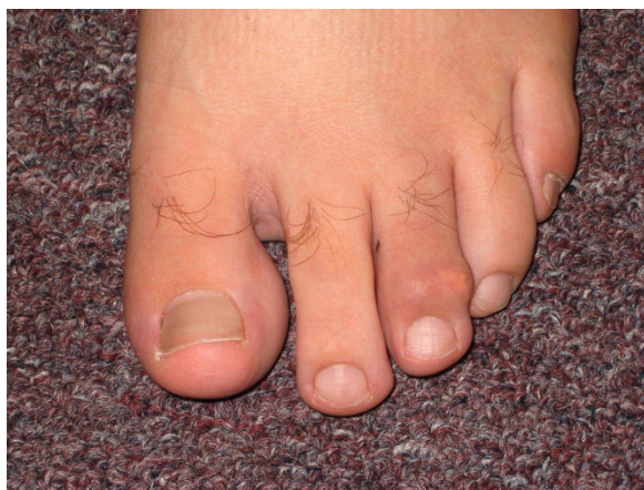
Figure 2 Left foot exhibiting diffuse swelling with prominent DIP involvement.

The exact pathophysiology of both rheumatic and immune-mediated disorders is not fully understood. It is