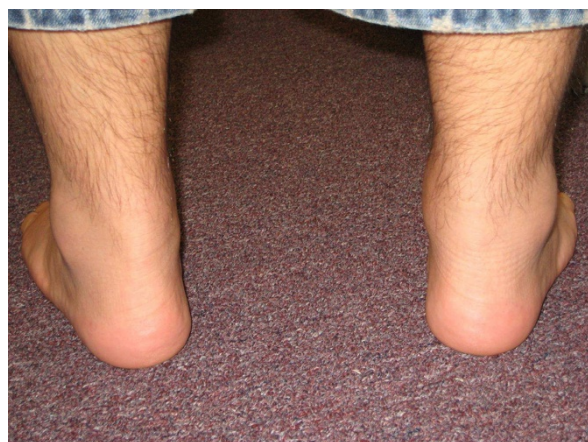
Figure 3 Posterior view of ankles showing swelling of the right Achilles tendon and periarticular swelling.

quite likely, however, that multiple factors including genetic predisposition, environmental factors such as CMV infection, drug exposure, abnormal reconstitution of the immune system, and direct transfer of pathogenic hematopoietic stem cells from the donor that could generate autoreactive clones in allogeneic transplants—possibly the case in our patient, might participate. Inflammatory cytokines, chemokines and adhesion molecules, particularly interleukin-8 and drugs used during SCT such as cyclosporine A or tacrolimus may also play an important role in inducing vascular endothelial damage leading to TTP-like syndromes.