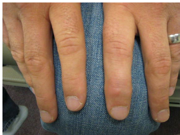
Figure 1 Left index finger demonstrating DIP involvement.