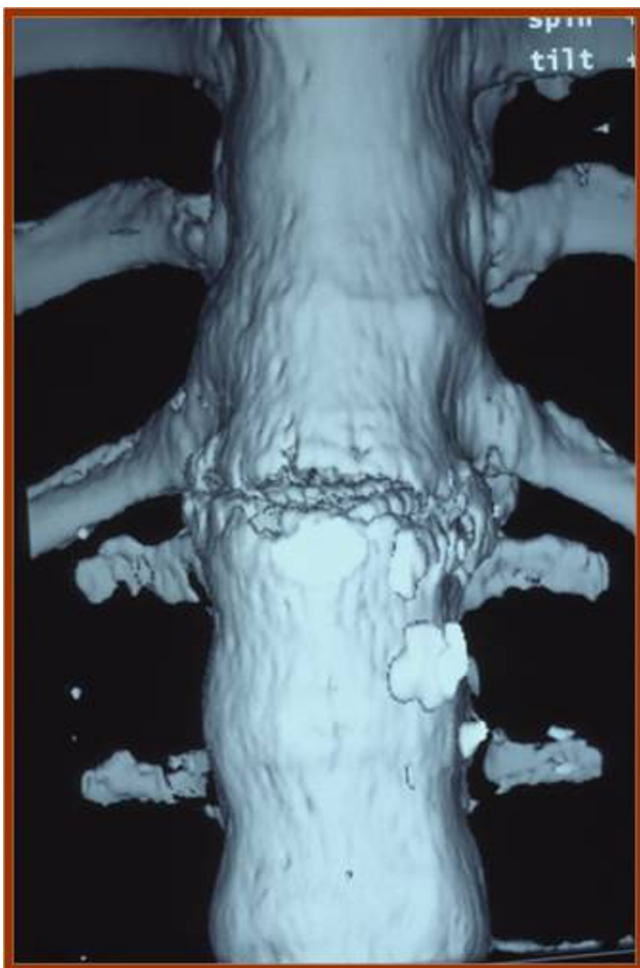
Figure 2 Anteroposterior 3D reconstruction image of the chance type fracture at T12-L1 level.