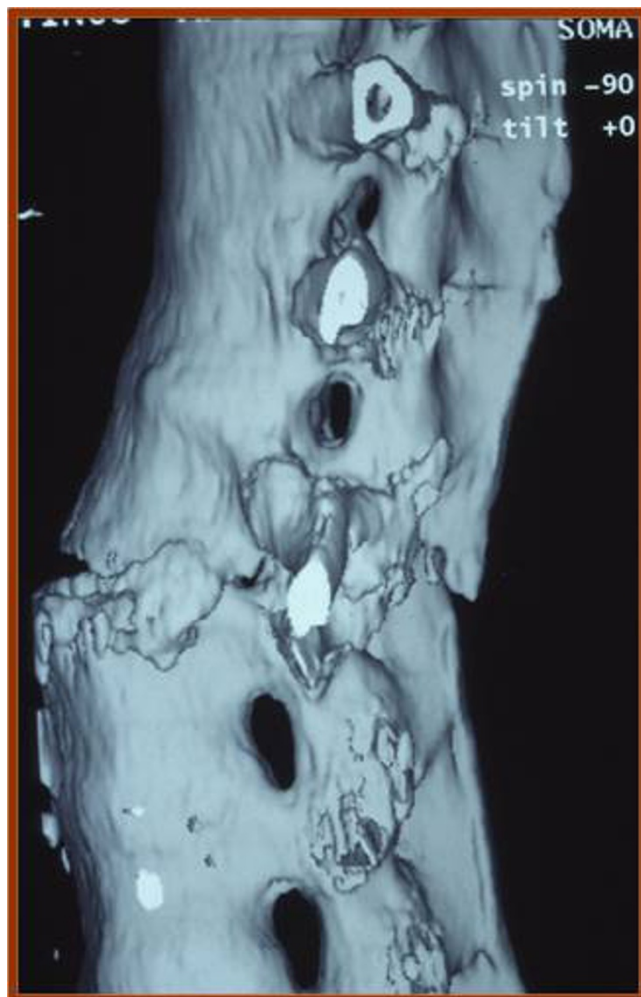
Figure 3 Lateral 3D reconstruction image of the same case.

as Frankel D and 10 patients (50%) as Frankel E. After the operation 3 patients (15%) classified as Frankel A, 4 patients as Frankel D (20%) and 13 patients (65%) as Frankel E (table 3).