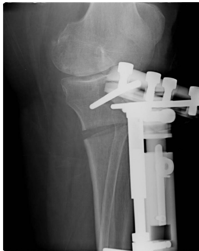
Figure 2 Radiograph of high tibial osteotomy using the hemicallotasis technique.

The association between preoperative knee alignment (HKA angle) and preoperative knee pain (KOOS subscale pain), and change in knee alignment with surgery (the difference between preoperative HKA angle and postoperative HKA angle) and change in knee pain over time was assessed by simple regression analyses. Multiple regres-