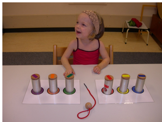
Figure 1 A two-years old child stringing beads.