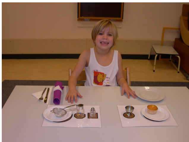
Figure 2 A five-years old child decorating a muffin.

end the task by cleaning the hands with a napkin (subtask 8). Age group 1 was not required to use the placemat and the cutlery. This difference resulted in seven subtasks for age group 1 and eight subtasks for age group 2.