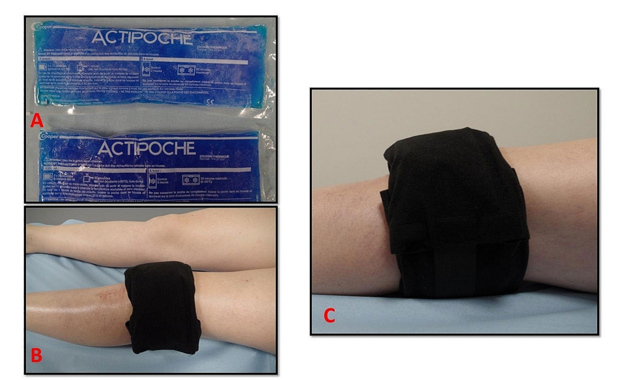
Fig. 3 Patient using standard cryotherapy with ice packs. (A) the Actipoche<sup>®</sup> cold packs were placed on the anterior and posterior sides of the knee; (B, C) patient set-up and use during the study