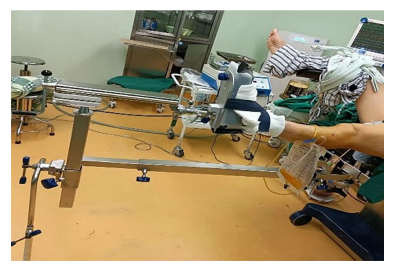
Fig. 1 Application of orthopedic traction table

The DRTR (Fig. 2) which mainly consists of a proximal fixator, a connecting rod, a bracket, a traction bow, a traction needle, and a proximal connecting device was used with the patient lying on an extended operating table. After tiling the anesthesia cloth, the anterior superior iliac spine was identified and a 3 cm oblique incision was made to expose the bone surfaces of both sides of the iliac crest. The proximal fixator of the DRTR was then fixed at the anterior superior iliac spine through transverse screws, which had to pass through the cortical bones on both sides of the anterior superior iliac spine to prevent avulsion fractures during traction. To ensure the intramedullary nail placement, the fixation point of the distal fixator was usually made 2 cm below the tibial tuberum,