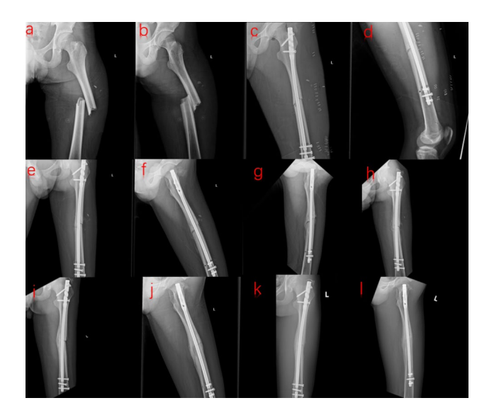
Fig. 4 Radiographs of a case after DRTR: ( a , b ) Preoperative anteriorposterior (AP) and lateral views; ( c , d ) AP and lateral views on the second postoperative day; ( e , f ) AP and lateral views one month postoperatively; ( g , h ) AP and lateral views three months postoperatively; ( i , j ) AP and lateral views 6 months postoperatively; ( k , l ) AP and lateral views 12 months postoperatively