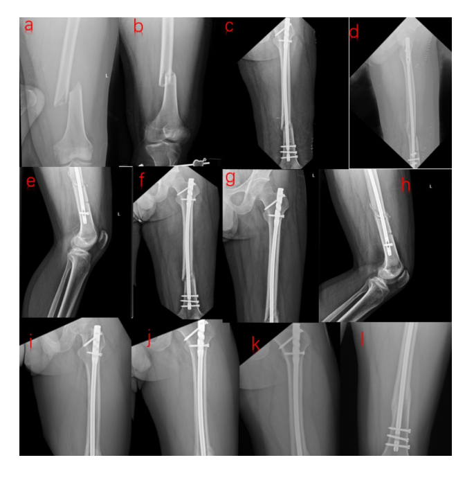
Fig. 5 Radiographs of a case following traction table group: ( a , b ) The preoperative anterior-posterior (AP) and lateral views; ( c , d ) AP and lateral views on the second postoperative day; ( e , f ) AP and lateral views one month postoperatively; ( g , h ) AP and lateral views three months postoperatively; ( i , j ) AP and lateral views six months postoperatively; ( k , l ) AP and lateral views 12 months postoperatively

the operation included: the patient's basic condition, injury mechanism, gender, BMI date, ASA, and fractal of fracture. During the Operation, data collected included the anesthesia type, operation time, blood loss, blood