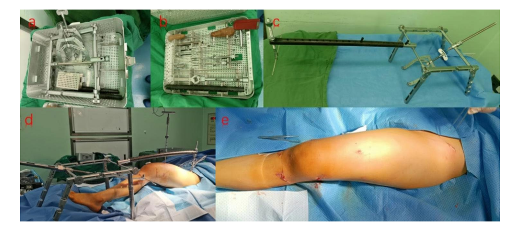
Fig. 2 Application of DRTR: (a, b) Composition and assembled shape of DRTR; (c) The general view post DRTR installation; (d) Intraoperative closed reduction of the fracture through the reduction device; (e) Postoperative wound condition of the patient