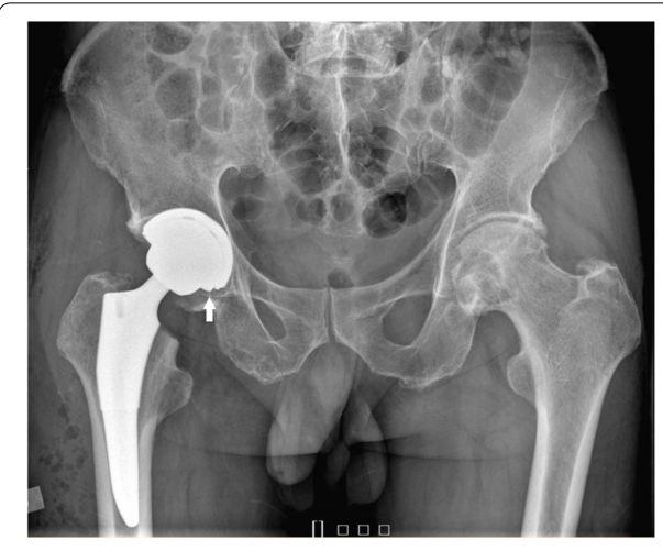
Fig. 2 Plain radiograph and computed tomography of pelvis immediately after the surgery. A protruding ceramic liner rim can be observed on a plain hip radiograph the day after THA. (arrow)

we recommended revision surgery. Although informed of the indication and necessity of revision, the patient refused since he had no symptoms. Given that consent for revision surgery was not forthcoming from the patient, we adopted a non-operative approach with routine rehabilitation protocol same as regular postoperative patients. The option of conducting revision surgery remains available when liner fragmentation or any related discomfort emerged in subsequent follow-up.