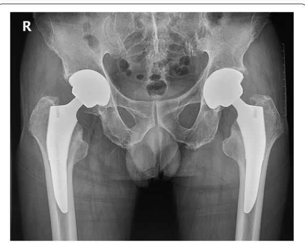
Fig. 5 Plain radiograph of pelvis 15 months after right hip arthroplasty. Plain pelvic radiograph shows no protrusion of the ceramic liner. The liner remained properly seated after spontaneous reduction

contributed to the ceramic liner dissociation reported in this case report.