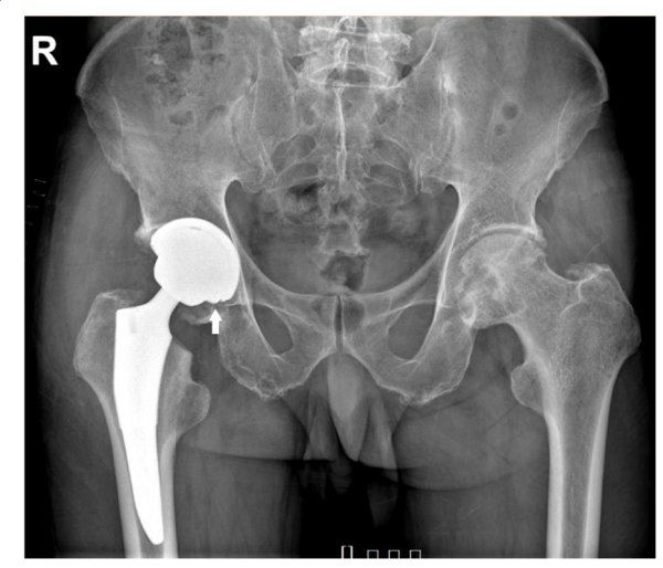
Fig. 3 Plain radiograph on the eighth day after the surgery. Ceramic liner dissociation can be observed on a plain hip radiograph (arrow), which is almost identical with the presentation on the radiograph of the first postoperative day (Fig. 2a)

of liner spontaneous reduction. He denied any discomfort in the right hip with a Harris hip score of 87, and the radiograph indicated no recurrence of liner dissociation (Fig. 5).