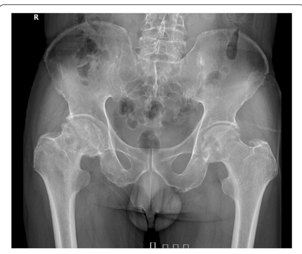
Fig. 1 Plain radiograph of pelvis before right hip arthroplasty. Bilateral Ficat IV stage avascular necrosis of femoral head is shown

On the first postoperative day, a pelvic plain radiograph showed a prominence between the femoral head and the inferior rim of the acetabular cup, which implied dissociation of the ceramic liner (Fig. 2). Considering the consequences of liner fragmentation and other complications,