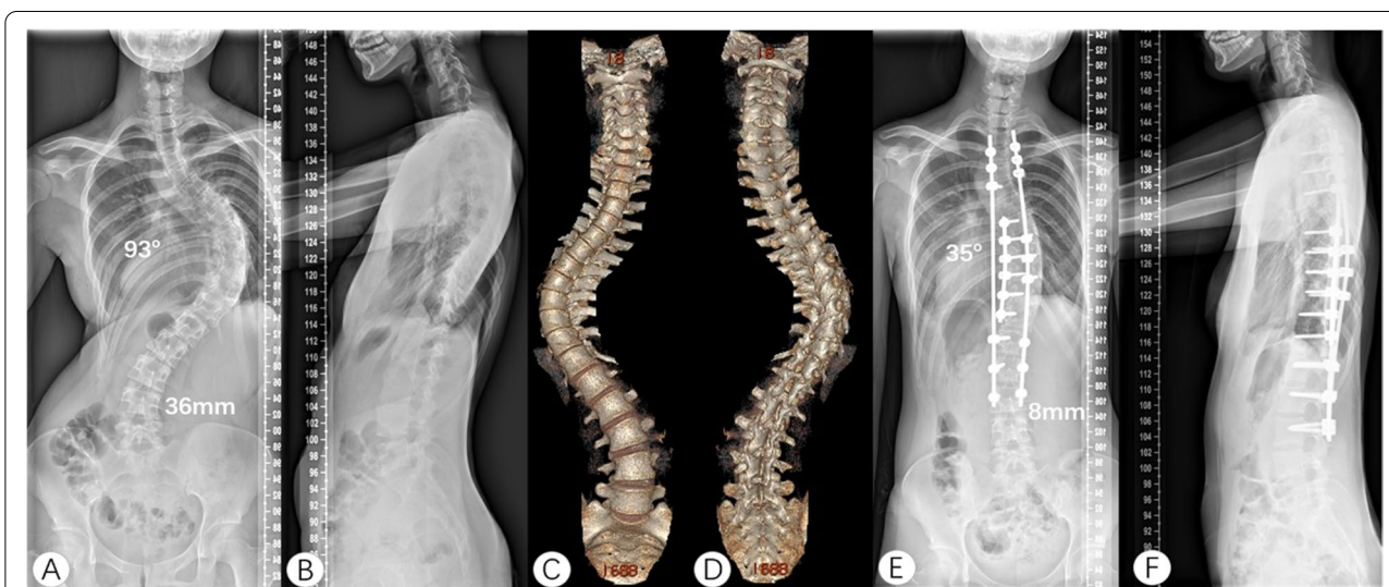
Fig. 3 A 15-year-old female with idiopathic severe scoliosis (Lenke 1AN). The preoperative Cobb angle of the main curve was 93° and TS was 36 mm (A, B). The last touching vertebra of CSVL on her spine 3D reconstruction was L3 (C, D). She underwent posterior surgery from T3-L3. After three years of follow-up, the correction rate was 62.4% and TS was 8 mm (E, F). The correction remained stable and the coronal balance was improved. CSVL, center sacral vertical line. TS, trunk shift

of 67% in 37 patients with severe and rigid scoliosis treated with VCR [22]. Other studies have reported that the correction rate of VCR in the treatment of severe scoliosis is 51%–59% [27]. However, the incidence of neurological complications and implant failure is high. Lenke et al. investigated the complications in 147 patients with severe spinal deformities who underwent VCR and found that 86 (59%) had intra- and