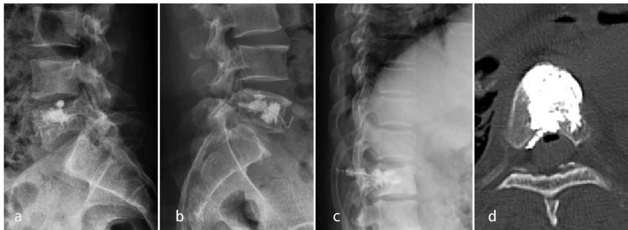
Fig. 3 The types of cement leakage. Intervertebral leakage (a). Venous plexus leakage (b). Puncture trajectory (pedicle) leakage (c). Paraspinal tissue leakage (d)