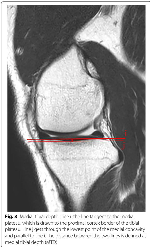
Table 1 Demographic data of the two groups