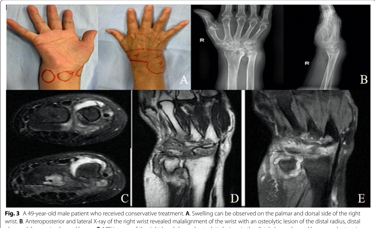
ulna, and the proximal carpal bones. C. MRI images of the right hand showed osteolytic lesions in the distal ulna and carpal bones, and extensive necrotic degeneration of the synovium and surrounding soft tissues of the wrist joint

for musculoskeletal TB. MRI can detect earlier changes, especially synovial thickening and periarticular soft tissue changes, and has even been shown to demonstrate "rice bodies" in the joint space [26]. MRI may demonstrate hemosiderin deposition in the synovium and demonstrate erosions that occur late in the disease and are usually centrally located. The absence of bone marrow enhancement on MRI accompanied by bone erosion suggests tuberculous arthritis rather than suppurative lesions [27].