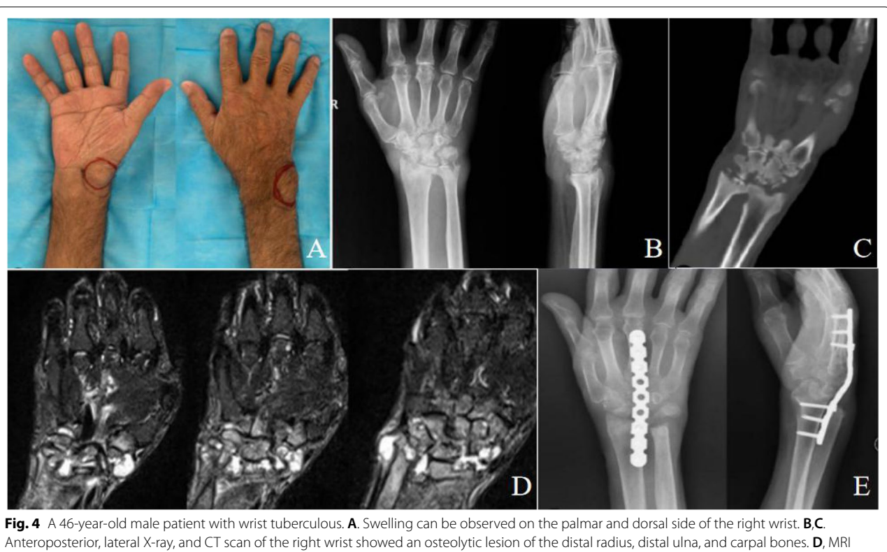
Fig. 4 A 46-year-old male patient with wrist tuberculous. A. Swelling can be observed on the palmar and dorsal side of the right wrist. B,C. Anteroposterior, lateral X-ray, and CT scan of the right wrist showed an osteolytic lesion of the distal radius, distal ulna, and carpal bones. D, MRI images of the right hand showed significant osteolytic lesions in the distal ulna and carpal bones, and extensive necrotic degeneration of the synovium of the wrist joint. E, Anteroposterior and lateral X-rays showed 28 months after wrist joint fusion by plate fixation

improvement and underwent surgery after 8 weeks of ATT. Many scholars believed that in order to prevent bone destruction and disease dissemination, preoperative ATT is essential [34, 35]. Two patients had a recurrence of infection 10 months and 11.5 months after the operation, including one patient with a history of multiple wrist steroid injections and the other patient who stopped ATT 3 months after the operation. The remaining surgical patients recovered after 12–18 months of