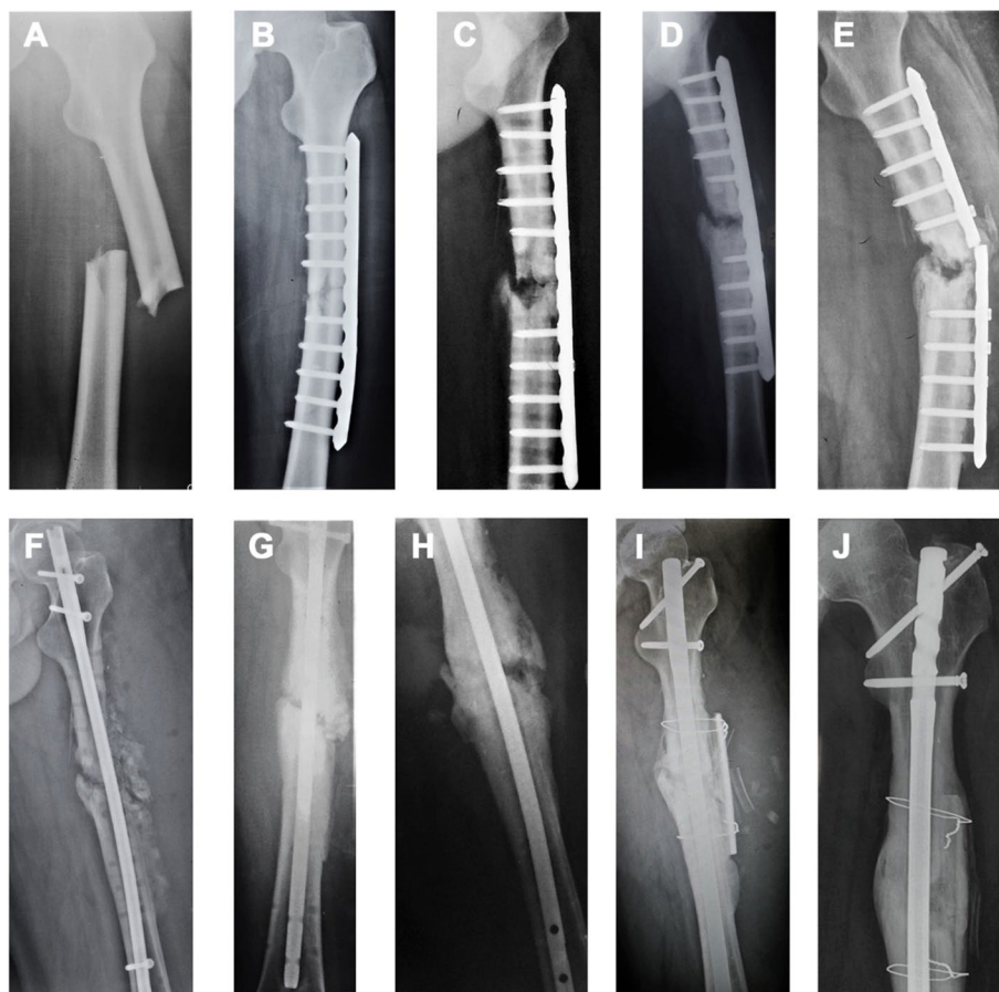
Fig. 2 A male, 26 years old, non-union of left femoral shaft for 23 months. A Displaced fracture of the left femoral shaft caused by a traffic accident. B Open reduction and internal fixation postoperatively. C Six months after the operation, the plate loosened. D The plate was re-fixed and bone grafted with autologous bone. E Six months after the second operation, the plate broke. F Intramedullary nail fixation and bone grafting with autologous bone. G Within 5 months after the third operation, the non-union site did not heal. And intramedullary nails dynamization was conducted with autologous bone grafting. H After the fourth operation, the non-union site still did not unite. I Intramedullary nail fixation. Due to the limited resources of the donor site, cortical allograft strut grafting was finally performed. J Allogeneic bone fusion and nonunion healing in 18 months after the final operation, and the shape was “biconvex.” The contralateral cortical site healed completely, and there was a creeping substitution between cortical allograft strut and femur. The periosteum of the femur has wholly crossed the strut

The treatment of long bone nonunion remains a considerable challenge for orthopaedists. This study showed that cortical allograft strut augmented with platelet-rich plasma could successfully treat long bone nonunions in the lower limb. Although autografts were fresh viable tissues with cancellous parts and the bone marrow, which were not only osteoconductive but also osteoinductive and osteogenic grafts, cortical allografts also have some superiority to autografts in terms of larger and longer size and more significant defects [7]. These echoed the findings of earlier research, and PRP seemed, to some extent, an attractive biological to enhance fracture healing [23]. The bone healing of nonunion on the midshaft clavicle, distal femur, forearm, humeral shafts, distal femoral was