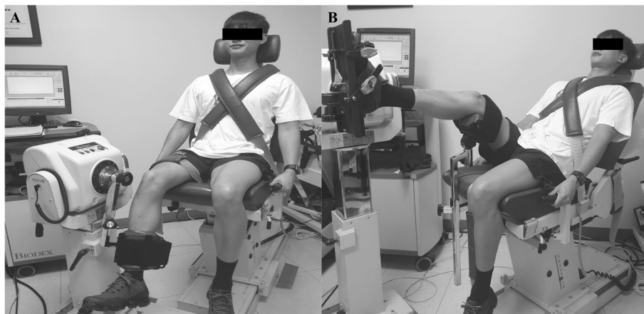
Fig. 2 Measurement of the strength and reaction time of the quadriceps, hamstring (a), and gastrocnemius (b) muscles