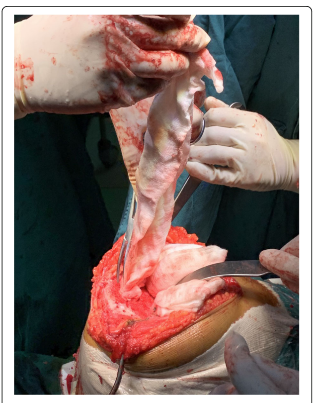
Fig. 1 Epinephrine-soaked gauzes are covered and pressurized on osteotomy sites of femur and tibia to address bleeding

This study protocol has been approved by the IRB of the authors' affiliated institutions. This is a retrospective cohort study of 143 patients who underwent a primary unilateral cemented TKA from January 1, 2018 to December 31, 2019 in our hospital. From the final analysis patients with prior surgery involving the femur or tibia, prior lower extremity fracture, coagulopathy and uncontrolled hypertension, history of myocardial infarction or stroke, and bilateral total knee arthroplasty were excluded. In the final analysis, a total of 101 patients fulfilled the study inclusion criteria and were available. The patients were analyzed in 2 groups. In the first group, one tourniquet was not used but prepared for bleeding out of control and gauzes soaked with 1-mg epinephrine mixed with 125-mL normal saline solution (dilution 1:125,000) were utilized to cover and pressurize for hemostasis on the osteotomized surface of the distal femoral and proximal tibial bones from the finish of bone resections to the start of cementing (Fig. 1). In the second group, one pneumatic tourniquet placed high on