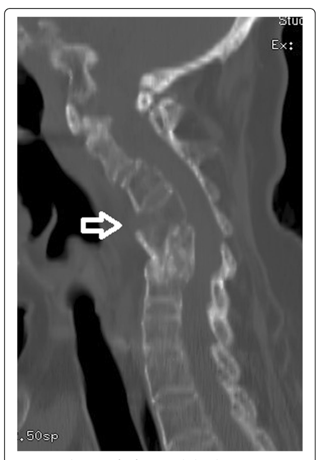
\ensuremath{\mbox{Fig. 2}} Sagittal CT scan after fracture with the white arrow pointing at the fracture line

A two-stage procedure involving halo-gravity traction followed by combined anterior and posterior instrumented fusion and multiple posterior column osteotomies was planned for her deformity correction. Since she weighed 110 pounds, maximum traction weight of 45 pounds was planned. Five pounds of traction was added after halo insertion followed by daily gradual increments of two pounds. The patient tolerated traction with no pin loosening nor cranial nerve palsies. At 14 pounds of traction weight, the patient complained of sudden neck pain and a loud cracking sound. X–ray taken immediately (Fig. 1c) with CT scan (Fig. 2). A fracture through the previously fused C4 vertebral body was found. There was