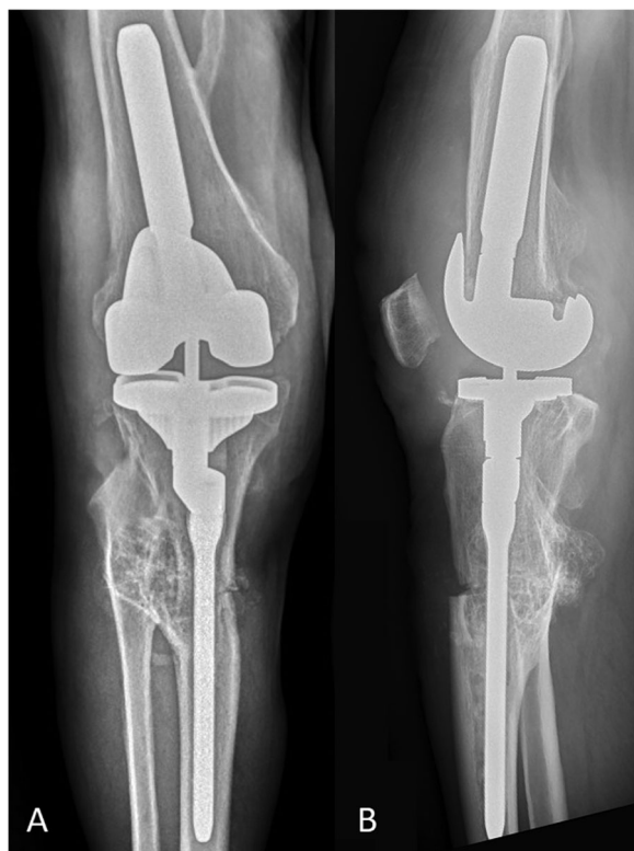
Fig. 4 X-ray views (a) AP and (b) lateral 10 days after TKA

One-stage TKA combined with tibial or femoral osteotomy are technically more demanding and challenging procedure which should be performed by experienced surgeons. This procedure seems to be more risky regarding to potential complications such as instability, nonunion, limited range of motion or infections [13]. In case of two-stage procedures involving osteotomy and subsequent TKA