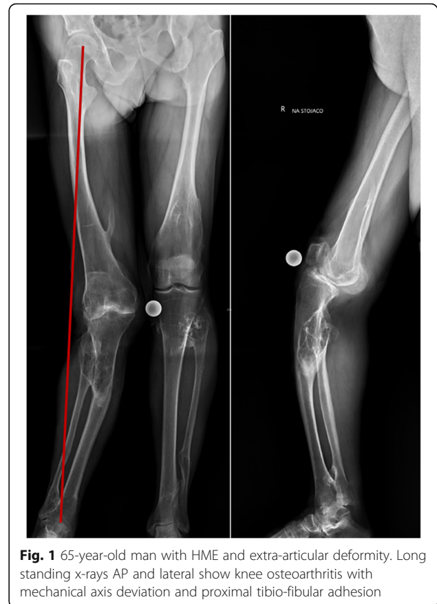
Fig. 1 65-year-old man with HME and extra-articular deformity. Long standing x-rays AP and lateral show knee osteoarthritis with mechanical axis deviation and proximal tibio-fibular adhesion

A long standing x-ray (AP and lateral view) and computed tomography (CT) were done. These examinations showed bilateral valgus femoral necks, 20° coronal and 40° sagittal tibial plane deviation, 15° valgus knee deformity with anterior subluxation, proximal tibio-fibular adhesion and 20° ankles deformations (Figs. 1 and 2). Regarding to clinical and radiological assessment, patient was qualified to one-stage TKA combined with TSO. Preoperative osteotomy planning and digital prosthesis templating were done with the use of OrthoView™ software (Fig. 3). Due to relatively low risk of development of malignant sarcoma transformation, negative histopathological findings in the past (after exostoses resections), no changes in preoperative x-rays in relation to x-rays made two years before the surgery, a bone scan to exclude malignant lesions was not performed.