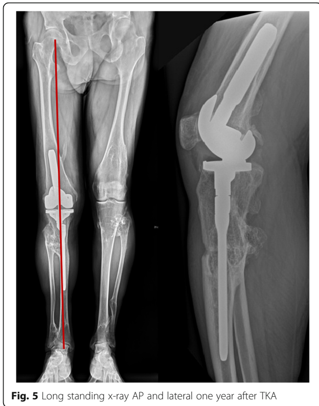
Fig. 5 Long standing x-ray AP and lateral one year after TKA

after bone union, we agree with Radke et al. that this method is not acceptable for patients [14].