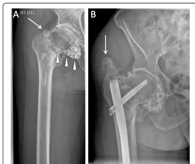
Fig. 3 X-Ray imaging of the right hip: (a) Intertrochanteric fracture noted by arrow. There is longstanding osteochondromatosis at the right femoral head [arrowheads]. (b) X-ray of the femur 13 weeks after surgery show post-surgical hardware and demonstrate Grade B HO at the left femoral head [arrow]

In general, patients with FOP should avoid surgery unless absolutely necessary because of the high risks of complications from intubation, the surgical procedure, and triggering of FOP flares. Although the patient was successfully intubated, the second intubation was extremely difficult and emphasizes the high risks of surgery on FOP patients. It is unclear whether this was due to the presence of skull fractures, residual facial soft tissue swelling, HO from the prior intubation, or some combination thereof. Fortunately, he suffered no significant complications from a longer duration of intubation or HO formation in the temporomandibular joint or surrounding tissues as a result. In addition, HO formed in areas near surgical interventions such as the hardware insertion tract through the soft tissues and around the