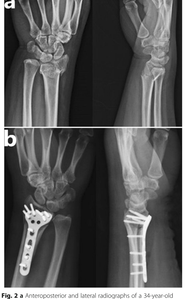
Fig. 2 a Anteroposterior and lateral radiographs of a 34-year-old female with AO C1 fracture before operation. b Posteroanterior and lateral radiographs taken immediately after operation showed that anatomic reduction had been obtained using a VLP