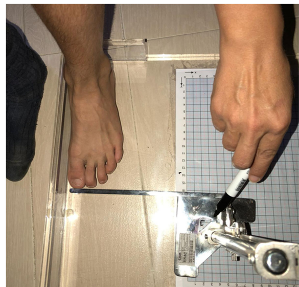
Fig. 1 Acetate sheet placed on a methacrylate base with a calibrated template imprinted for FL and FW measurements

Unlike the measuring devices used in other studies [11, 13], our measurement took into account the maximum length of the foot according to the digital formula of the schoolchildren. To achieve this, we considered three different digital formulas, Egyptian foot formula (first longest toe), Greek foot formula (second longest toe) or square foot formula (first and second toe of the same length). To perform the measurement, the interior capacity of the footwear was taken into account taking